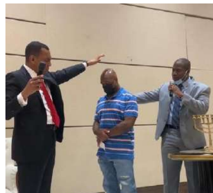
MR. RODNEY'S FIRST TIME IN THE UNIVERSAL CHURCH, AFTER BEING RELEASED FROM PRISON.

The wisdom of God now guides him. Not only is his life transformed,