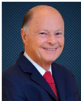
Bishop Edir Macedo

Call 1.888.332.4141 Text 1.888.312.4141 For more information SEE PAGE 12 FOR LOCATIONS